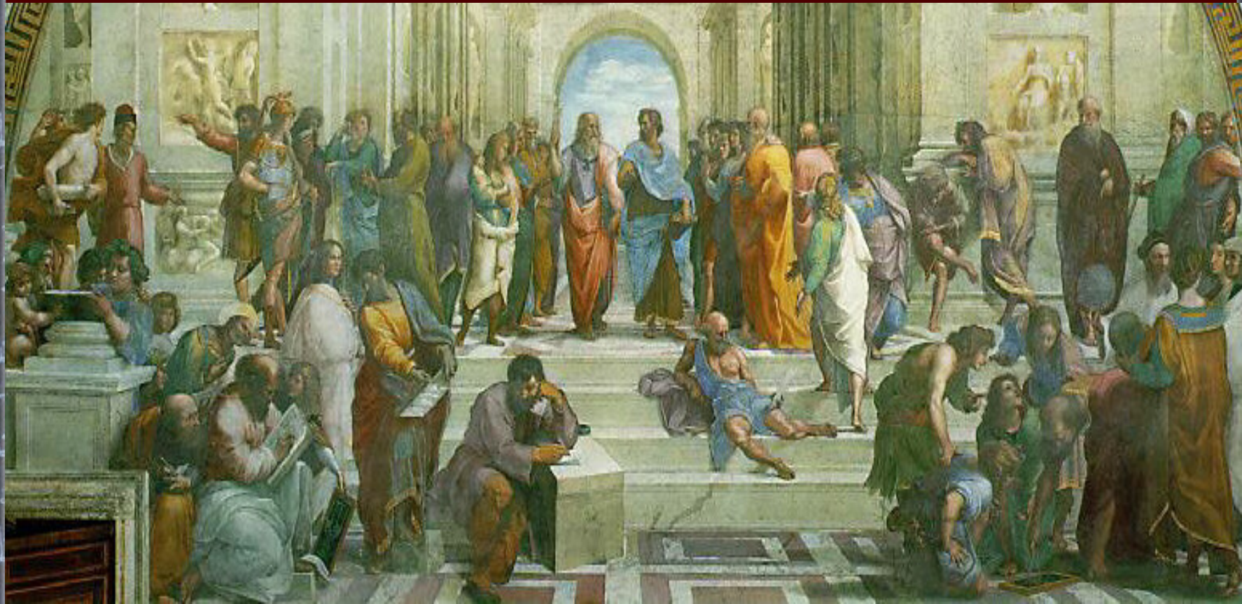
8 Raffaello Sanzio, The Athens School