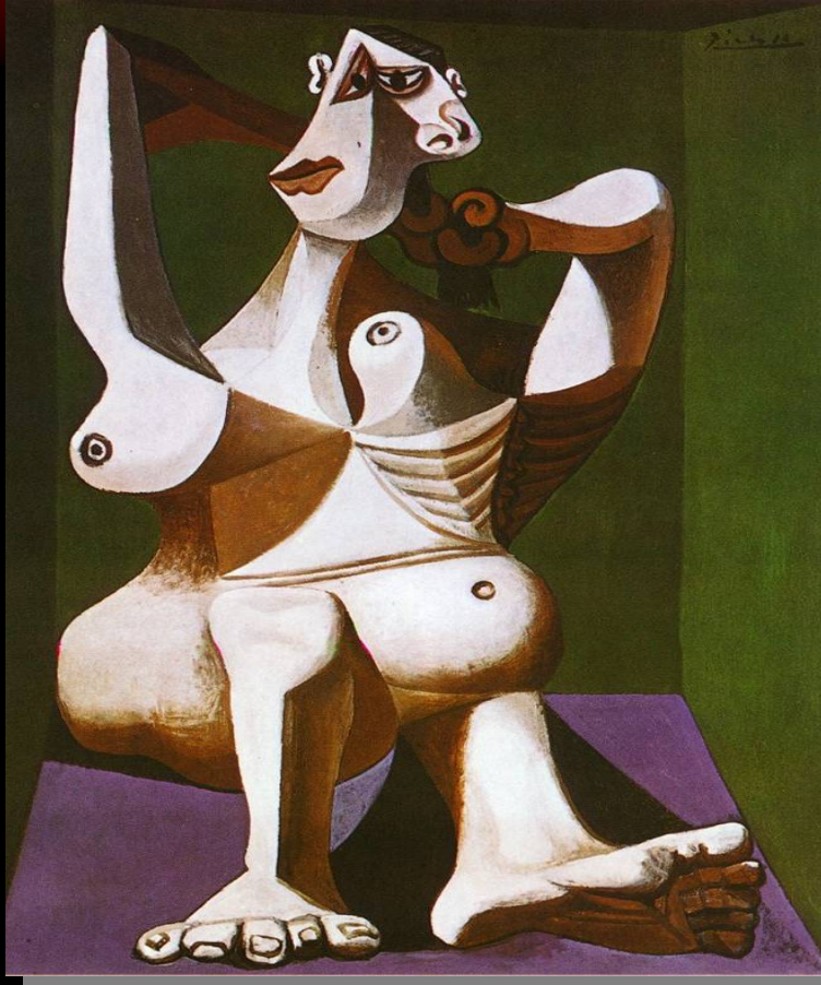
P. Picasso "F. Picasso, coiffant" 1940 Period