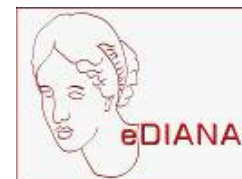
ARTEMIS eDIANA Project