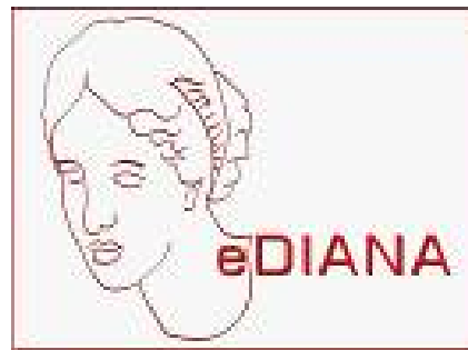
ARTEMIS eDIANA Project