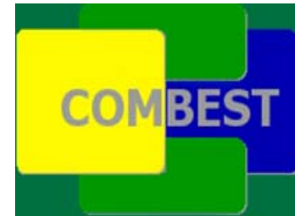
FP7 COMBEST Project